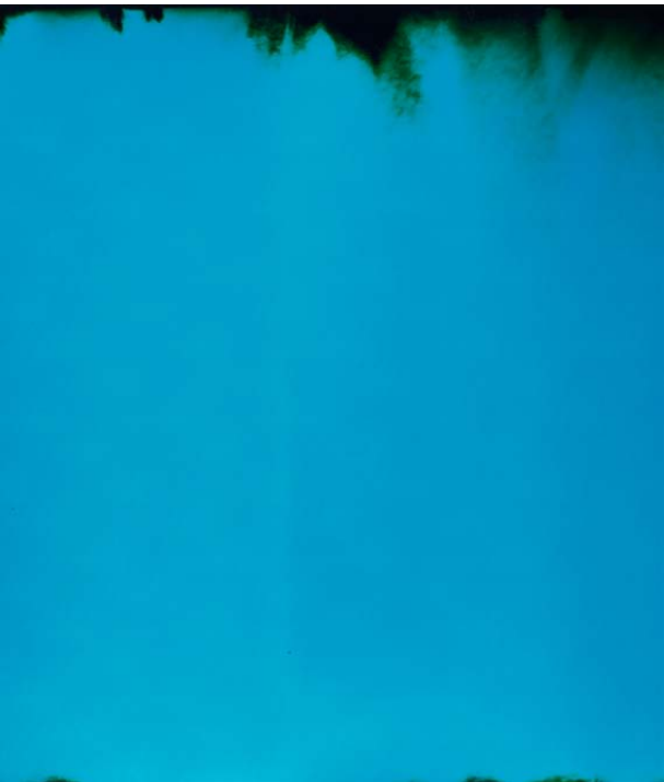
The Day Nobody Died IV, June 10 ( Detail )