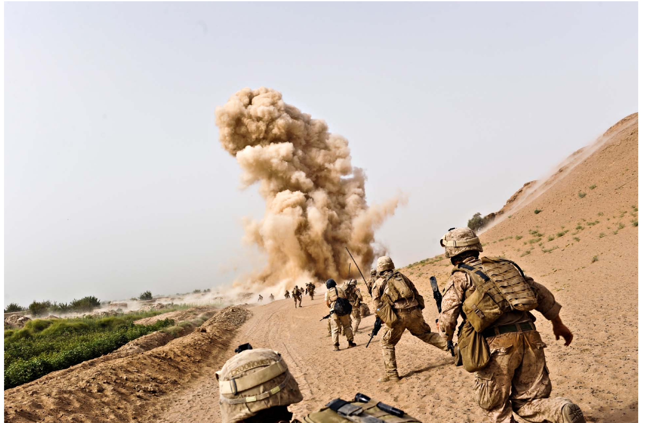
Afghanistan, August 16, 2009. An I.E.D. detonates on a Marine patrol

In both instances, these images convey the quotidian—how soldiers pass their days, the responsibilities they bear, what they eat, wear, carry—but the video of The Day Nobody Died provides a critical angle. The viewer experiences not only the discipline and routine of a soldiers' day-to-day, but the checks on their free will. We likewise see what can and cannot be recorded or accessed by the journalists allowed to join them. Broomberg and Chanarin include moments where they are asked to turn off the camera. When they comply and we understand that something is inaccessible. Broomberg and Chanarin's work focuses particularly on these liminal images, which foreground occlusion as much as they convey information. For the pair, an image is an index, a placeholder that conjures a reality perceived only indirectly, more imagined than experienced. The viewer is denied the satisfaction—or catharsis—of experiencing the historical record as it is made, but awareness of the limits to our access produces another sort of knowledge. We see another veil, and that we can't lift it is its own curiosity.