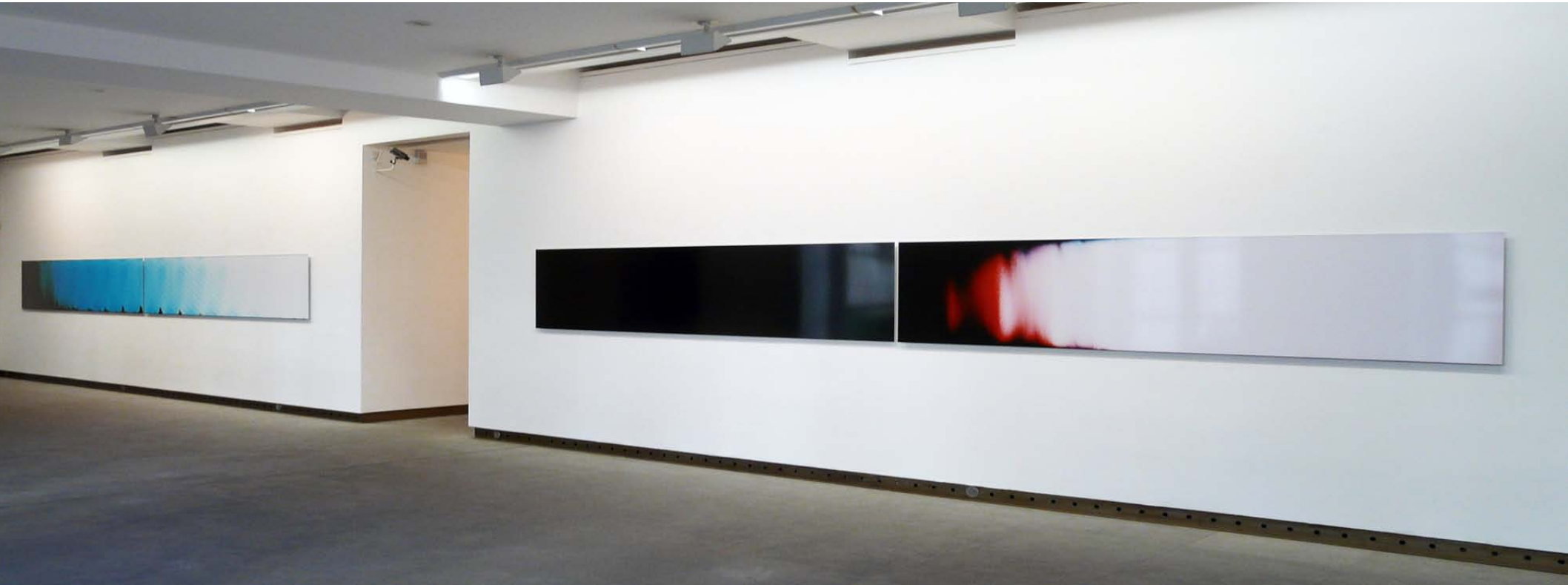
The Day That Nobody Died , Installation View, 2008

We do not have all the sensory information we are used to in these works, and yet they do not entirely rob the viewer of knowledge. In Broomberg and Chanarin’s strategy, titles become essential to understanding images; their sequence tells a narrative, however arbitrary. Producing these non-figurative, singular photographs borne of action but not depicting it, they strip photojournalism to a certain essential: how a viewer constructs a story from a sequence of photographs. With Broomberg and Chanarin on the one hand and van Agtmael on the other, scraps of information are provided that form a narrative. With van Agtmael’s work, when we encounter an image (a landscape, a face), we connect it to an event (a battle, a death) as an abstract corollary in our imagination. In Broomberg and Chanarin’s work,