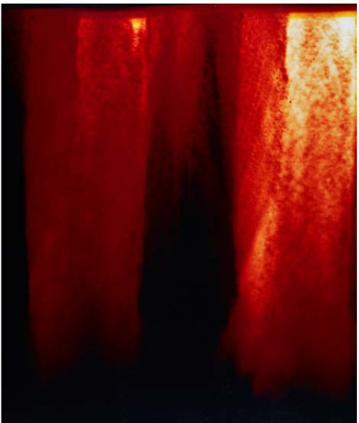
The Fixers Execution, June 7, 2008 ( Detail )